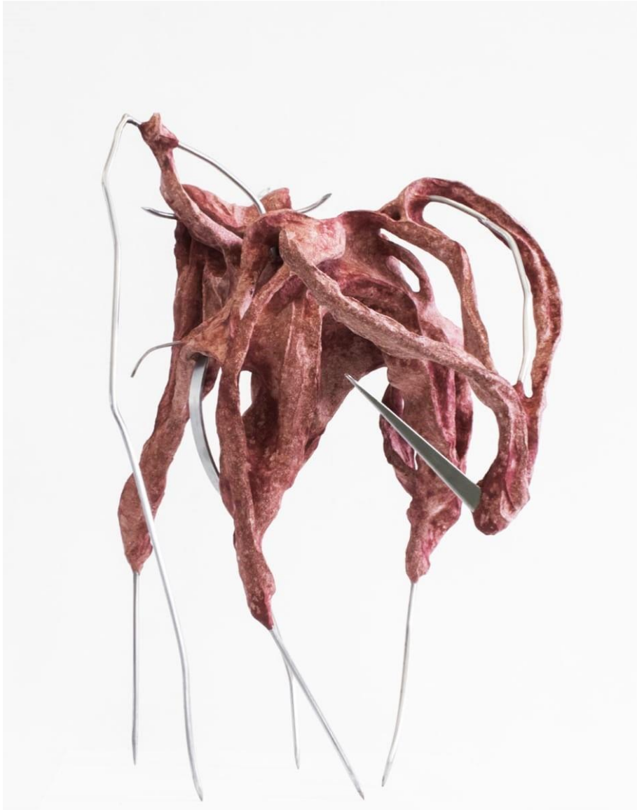
Camilla Alberti , Saltational Monsters, Mostro 2, 2024

Aluminium, plaster, cellulose, iron oxide, bone dust, coal and brick dust