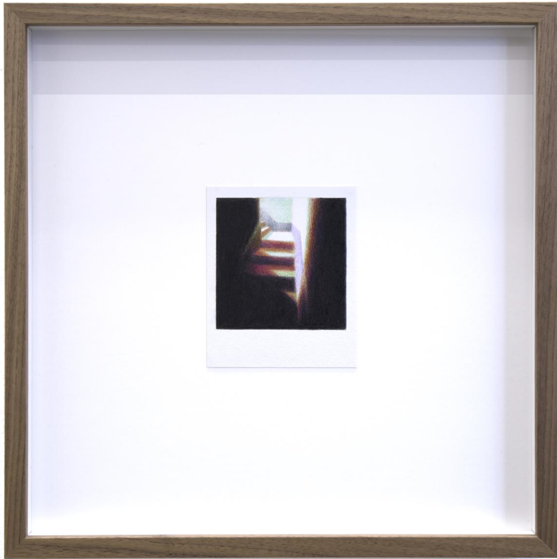
Steffen Kern , Stairs, 2026

Black pastel and color pencil on paper, framed