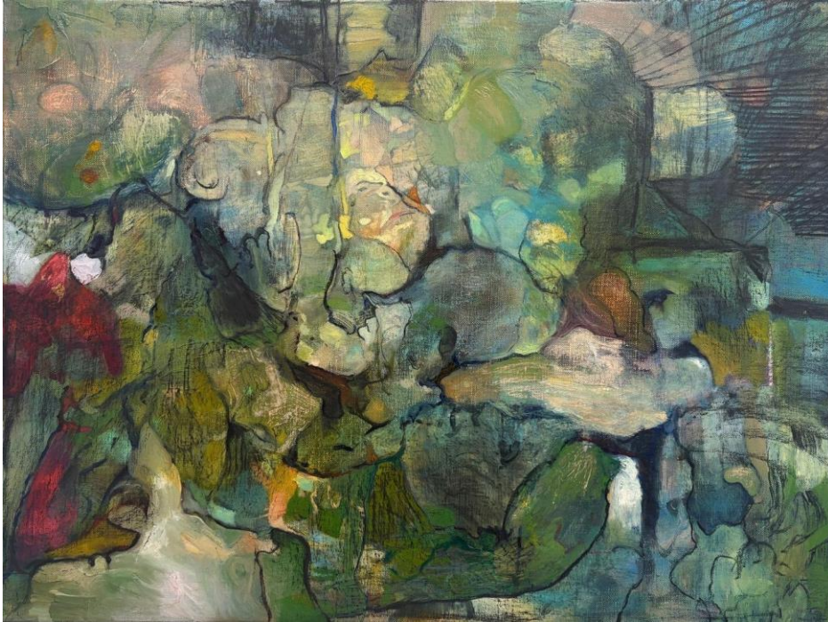
Amber Wynne-Jones, Art of Mirrors, 2025