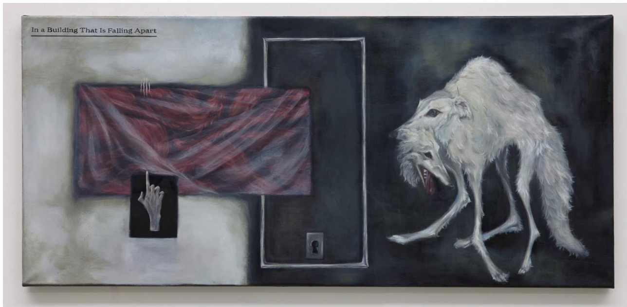
Ruby Chen , In a Building That Is Falling Apart, 2025