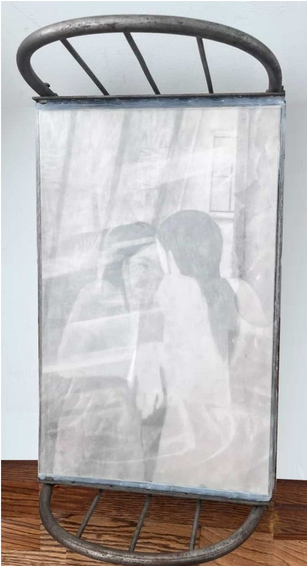
Naomi Hawsley, Untitled, 2026

Graphite on vellum and newsprint, silicone, acrylic, artist's frame