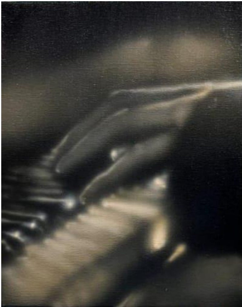
Stephen Buscemi, Small Song, 2024