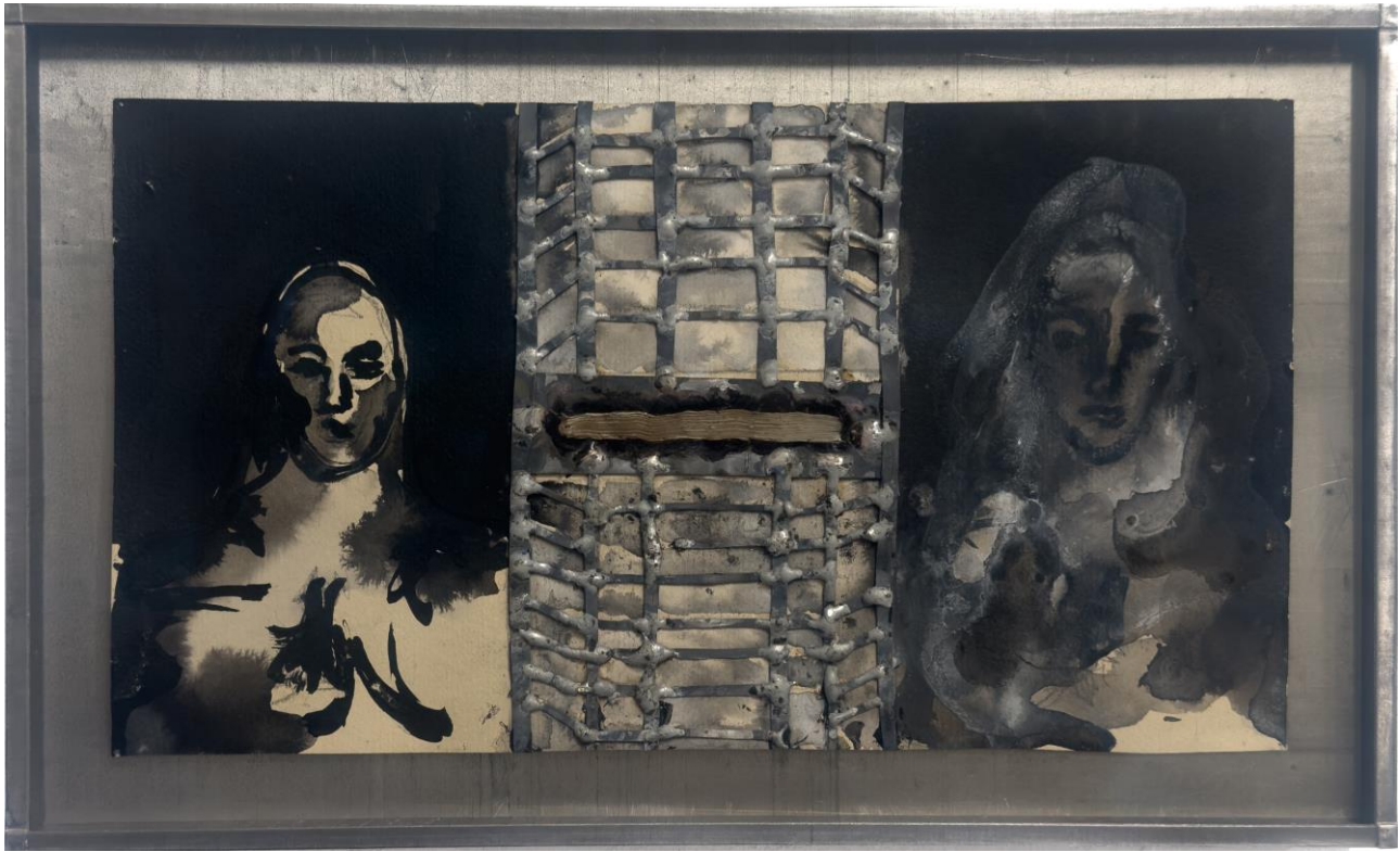
Mounir Eddib , The Pit, 2026

Ink and lead on unbleached cotton paper, framed in lead