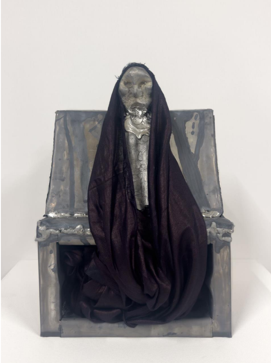
Mounir Eddib , Insider-Outsider , 2026

Wood covered with lead, tin and indigo-dyed textile