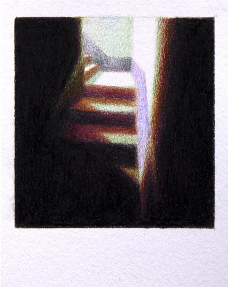
Steffen Kern , Stairs, 2026