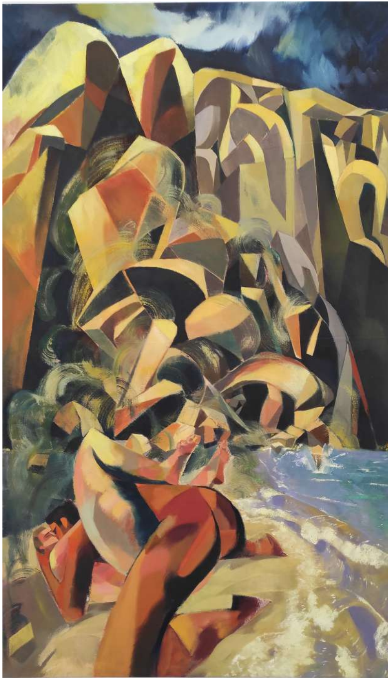
Chronos, 2023 Oil and acrylic on linen 60x35 inches