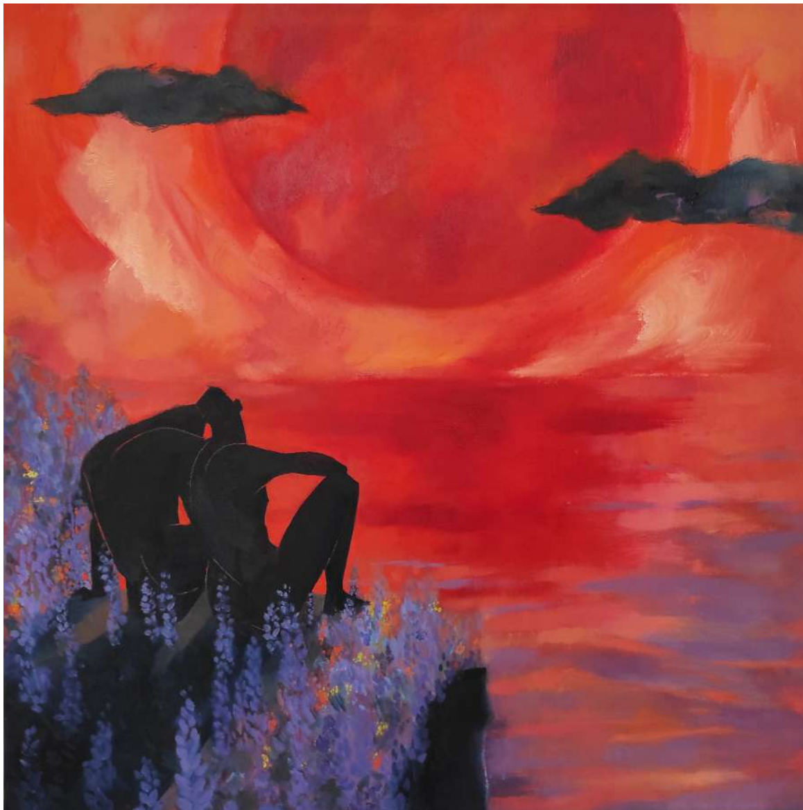
Lupine, 2023 Oil and acrylic on linen 35x35 inches