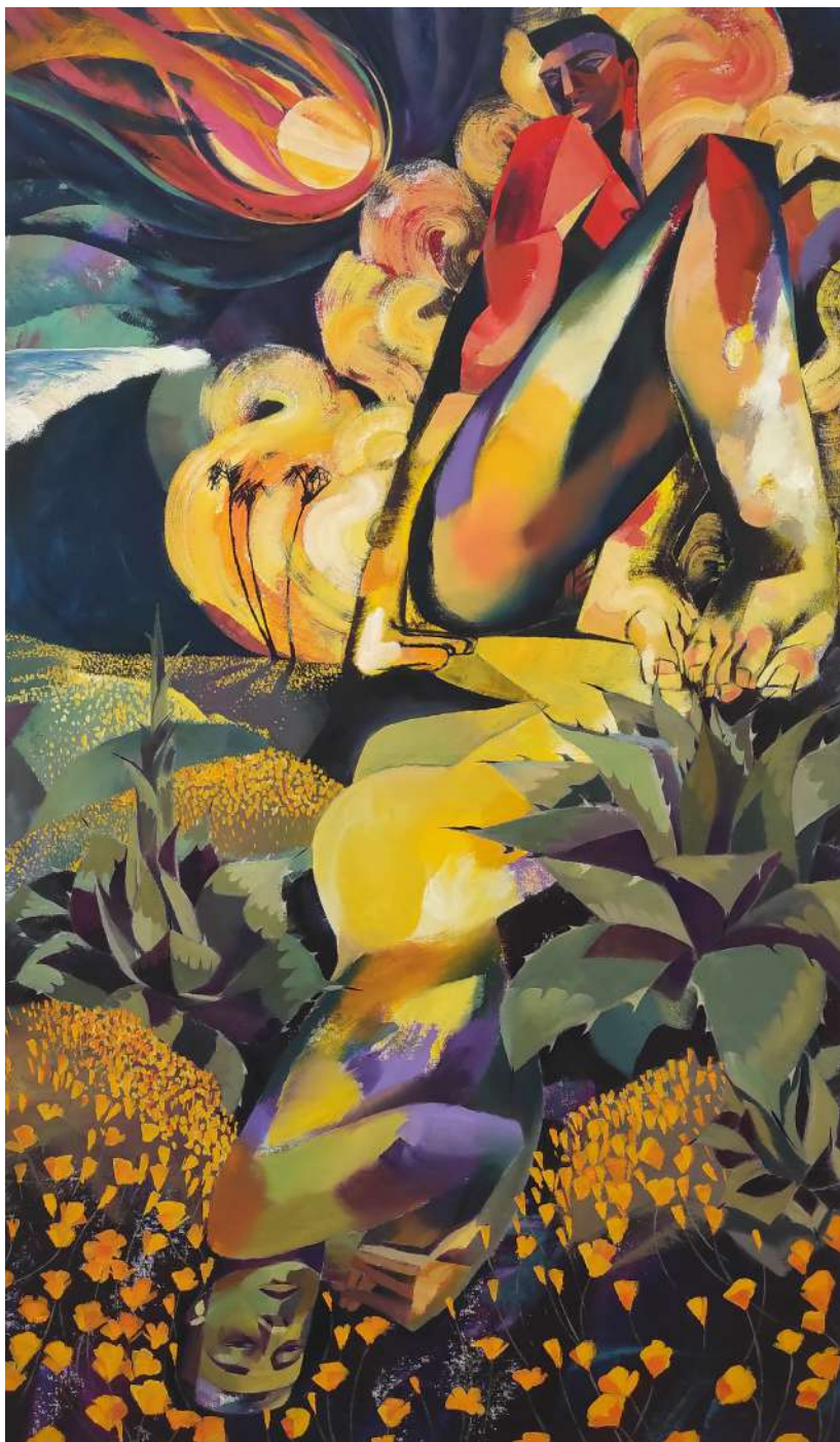
Prometheus, 2023 Oil and acrylic on linen 60x35 inches