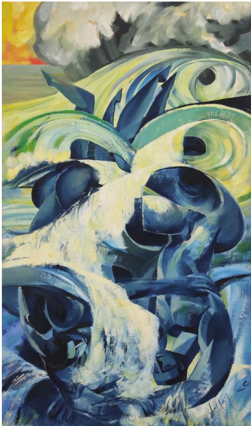
Oceanus, 2023 Oil and acrylic on linen 60x35 inches